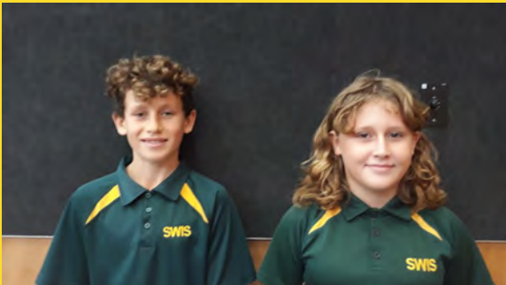
Room 14: Manawa and Ferne